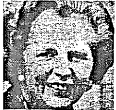
SEE PAGE 13

Maggie loses her shine, Tories slide in new MORI poll